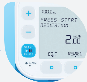
Two steps to infuse