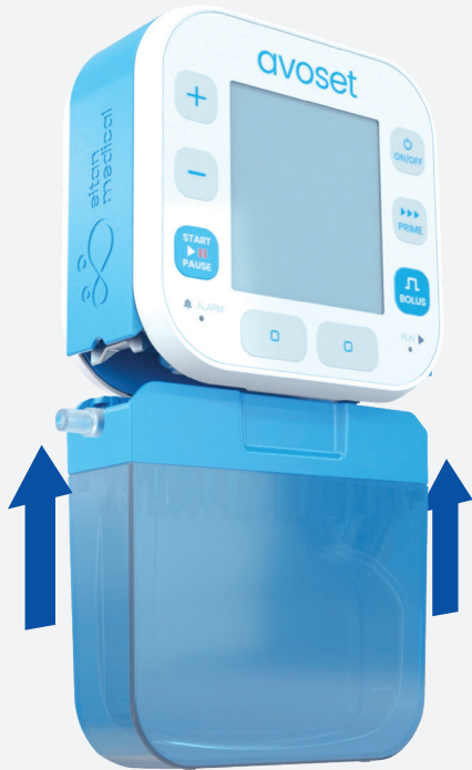
One click set loading